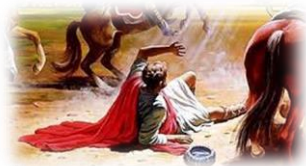
Paul on the Road to Damascus

Midst of Circumstances!” During the Advent Season (beginning Holiday Depress is REAL! December 3 rd ), as we prepare for the joy of Jesus' birth, our studies will focus on members of Jesus' family who came from “less than perfect” situations. Matthew's genealogical account of Jesus' family ( Matt 1:1-16) shows people like Tamar, Rehab, Bathsheba, and Ruth. I believe Matthew lists them to show that because no family is perfect—not even Jesus'—we must find happiness in the “Midst of Circumstances!” In the lessons prior to Advent, as we lead up to Thanksgiving, we will also focus on “Giving God Thanks in the Midst of Circumstances.” This evening, our focus begins with the Apostle Paul.